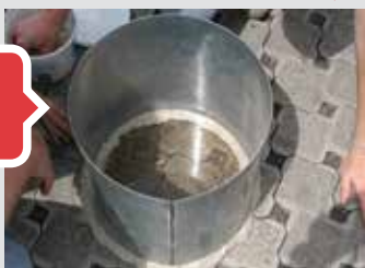
Adequate measurements of infiltration can be obtained with a single ring infiltrometer.