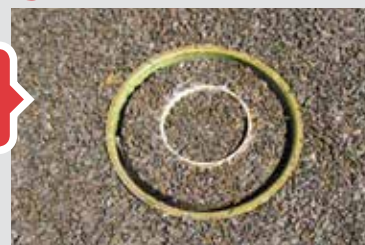
A double ring infiltrometer that is recognized by the EPA

Both methods will provide a good indication of the condition of the surfaces. In general, most new surfaces have an infiltration rate that exceeds the requirement for a one hundred year storm. Therefore, absolute accuracy may be more than is needed to establish the need to restore a surface.